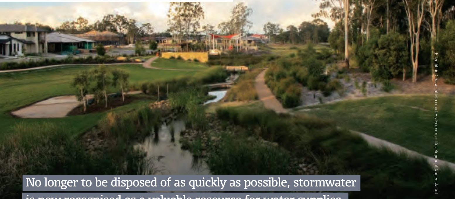
Fitzgibbon Chase