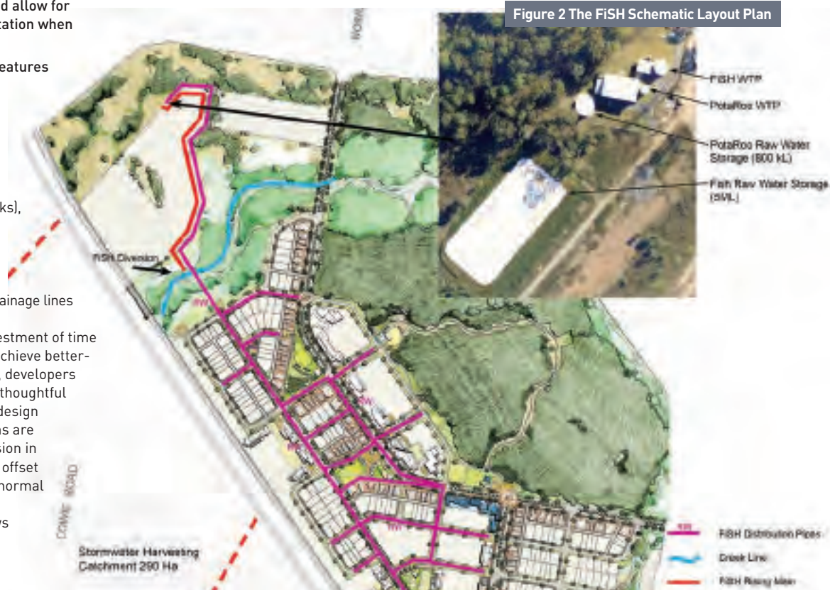
Figure 2 The FiSH Schematic Layout Plan

The FiSH project will divert urban stormwater runoff from the drain running through the UDA, pump it to a large raw-water storage unit, then treat it by filtration and disinfection prior to distribution via a third pipe dual-reticulation system. The project will supply non-potable water for irrigation, toilet flushing, cold water to laundries and outdoor uses throughout Fitzgibbon Chase. A schematic plan layout is shown in Figure 2 below.