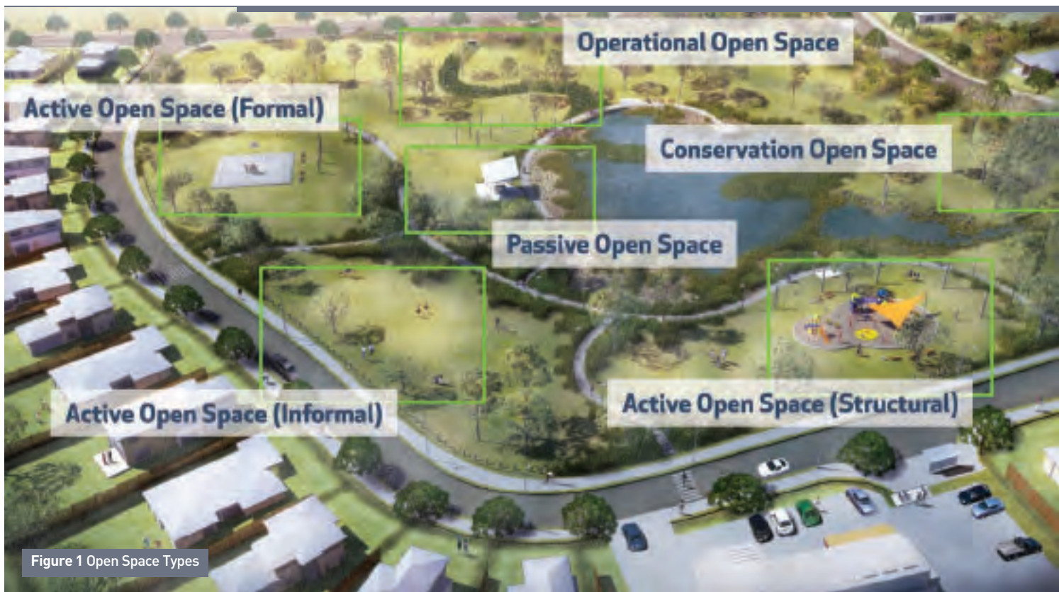
Figure 1 Open Space Types

The investigation presents a proposed framework that includes design standards for different types of open space based on research, case studies, and stakeholder consultation. Broadly, the framework identifies that areas used for both WSUD and public open space must: