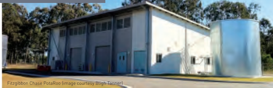
Fitzgibbon Chase PotaRoo

This article presents three case studies, illustrating how this is occurring. The first is about the community, explored through work completed by Bligh Tanner in collaboration with Place Planning Design and Water by Design, and investigates the multiple uses of public open space. The second is about the environment; examined through a special educational needs school completed by Bligh Tanner including a novel approach to managing stormwater so as to mitigate environmental impacts. The third