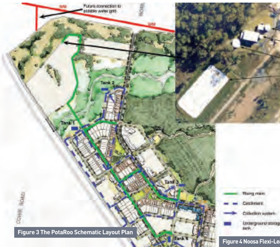
Figure 3 The PotaRoo Schematic Layout Plan

The three case studies that have been explored in this article provide at least part of a blueprint, demonstrating the potential of stormwater to overcome water shortages and improve environmental and community outcomes. Engaging with stormwater provides a valuable opportunity to embrace the concept of a Water Sensitive City, ultimately improving the liveability of our urban places.