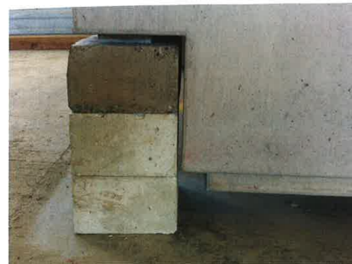
Figure 4: Support at the panel end during the full-scale test.

The design of the passive and low energy thermal control systems was developing at the same stage, and was pushing the floor systems toward high thermal mass with active heat exchange by the pumping of air or water through a concrete slab system. The next logical iteration of the design was to precast geopolymer concrete floor panels with incorporated hydronic pipes coils. To maximize the effectiveness of the radiant heat transfer from the concrete, the soffit needed to be exposed with maximum surface area. This then led to the development of vaulted soffit panels, which were both visually appealing, of high thermal efficiency and reflected light down onto functional spaces (Figure 3). Suspended ceiling panels contained lighting, communication technology and sprinklers. Various forms of the 11-meter-span (36-foot) panels were explored, which allowed for air distribution in a plenum/services void above