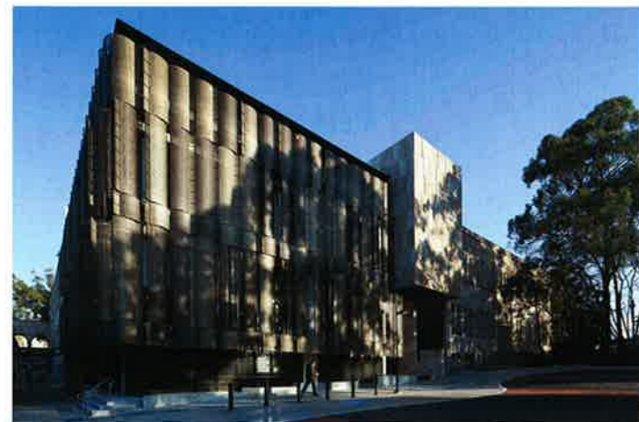
Figure 1: Completed Global Change Institute building.

Early in the design, the structural engineering team explored the potential for the incorporation of structural timber. The work at the University of Technology, Sydney, developing and testing