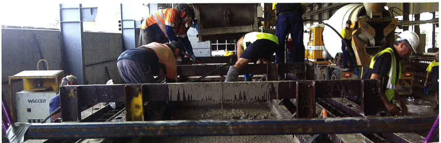
Concrete finishing in the precast factory.

A similar article was presented at the Concrete 2013 Conference, October 2013 in Queensland, Australia. It was also used as a reference document for media releases and other media articles.