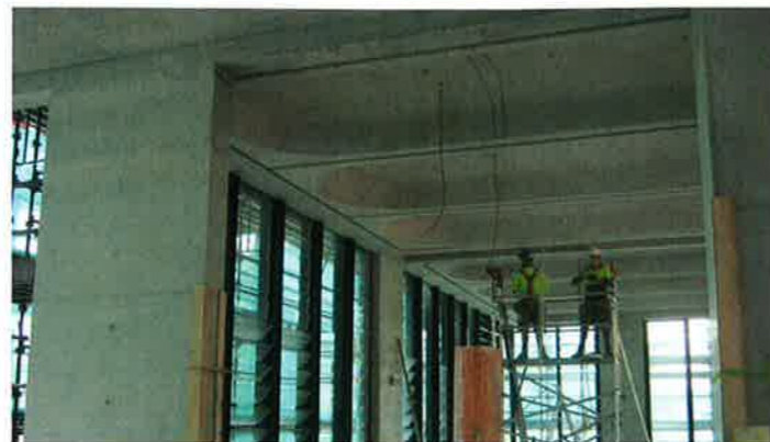
Figure 3: Global Change Institute – vaulted panel soffit.

Timber-Concrete Composite (TCC) floors, was of interest and was proposed as a potential floor system that combined the benefits of timber framing with the acoustic, fire separation and wearing properties of concrete (Figure 2). It was at this stage that the strong potential for use of geopolymer concrete in the system was identified, as the structural topping would be working at low stress and precasting of the TCC panels would enable quality control in a factory environment. Use of precast was also recognized as advantageous considering the very limited site.