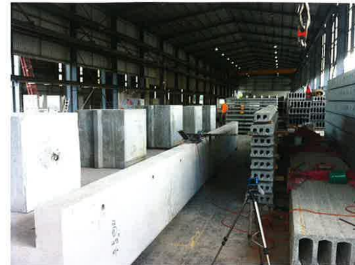
Figure 5: Full scale load test at precast factory.

Geopolymer concrete was included in the design for the 33 precast floor beams (320m 3 = 419 c.y.) that formed three suspended floors in