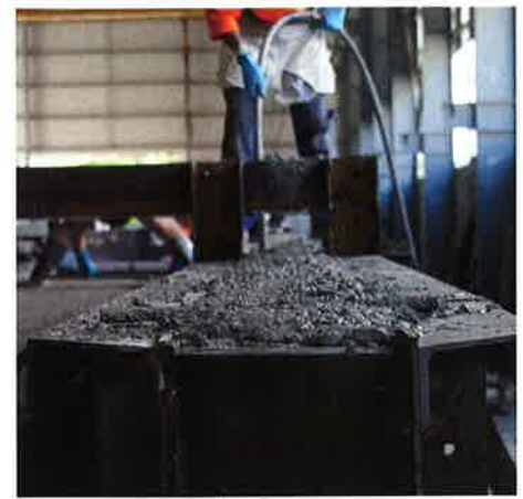
Figure 7: EFC geopolymer concrete being vibrated into the beam molds, at Precast Concrete Pty Ltd factory, Brisbane.

Geopolymer concrete has now moved beyond an emerging technology into the space of a structural concrete that can be designed and used in structures and other applications, as long as the necessary verification and testing is undertaken. The term geopolymer is very broad and encompasses a range of different concretes which