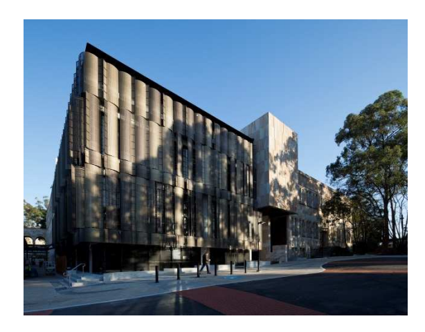
Photograph 1: Global Change Institute, University of Queensland

This paper is written from a design process perspective to demonstrate how recent innovations in material technology can be incorporated into a construction project. The chief author is a Director of Bligh Tanner, a medium sized civil, structural and environmental consulting engineering business that has always sought to develop and utilise new technologies, particularly in relation to positive environmental outcomes.