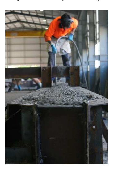
Photograph 7: EFC geopolymer concrete being vibrated into the beam moulds at Precast Concrete Pty Ltd factory, Brisbane

A practical beneficial aspect of geopolymer concrete in relation to travel time, is that loads can be batched with all ingredients except the activating chemicals and transported up to 12 hours or more to a remote destination in a completely dormant non-reactive state. At the destination the chemicals are added in a dry powder form directly into the Agitator bowl and mixed on site. Using this method the geopolymer concrete was transported from Toowoomba to Brisbane, and activated when the precast factory was ready for casting.