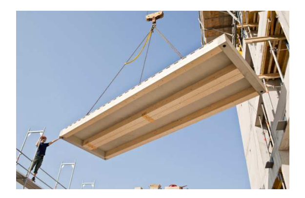
Photograph 2: Timber concrete composite floor panel

environment. Use of precast was also recognised as advantageous considering very limited site access off Staff House Road and a site bounded by existing buildings on 3 sides.