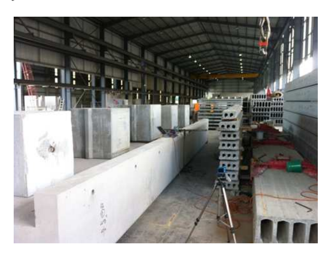
Photograph 6: Full scale load test at precast factory