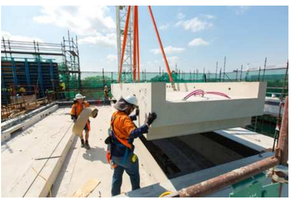
Photographs 8 and 9: Precast geopolymer beams installation

Following installation, sealing of the precast EFC geopolymer beams was undertaken on site. Several patch trials were carried out to ensure compatibility between the geopolymer concrete and proprietary sealers.