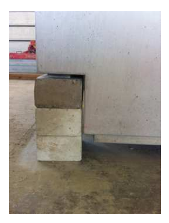
Photograph 5: Support at the panel end during the full scale test