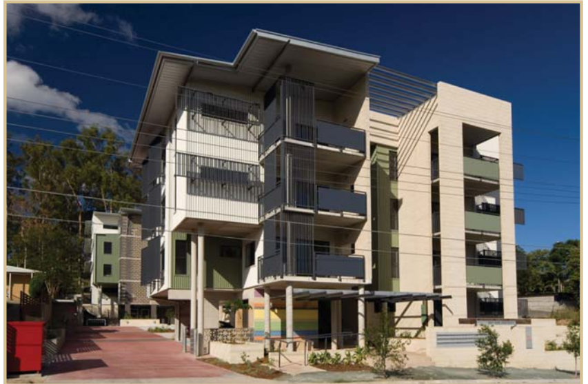
Kelvin Grove Urban Village – Low cost housing combined with high quality design

Brisbane Housing Company's Grey Gums development in the Kelvin Grove Urban Village demonstrates that low cost housing doesn't have to be low quality.