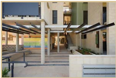
Grey Gums entry

Winner – Overall Winner (in combination with 3 other BHC buildings), Planning Institute of Australia Queensland Awards for Planning Excellence 2007