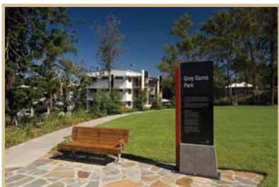
Grey Gums Park