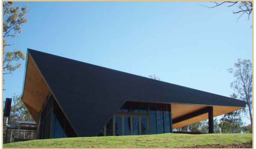
Side view of the Chapel

The Boyne Island Crematorium is a new community facility located on the banks of the Boyne River, outside Gladstone, that includes a chapel, tea house, cremator and administration rooms.