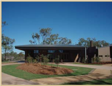
Entry to the Chapel

Winner – Central Queensland Building of the Year Royal Australian, Institute of Architects Queensland Regional Awards 2008