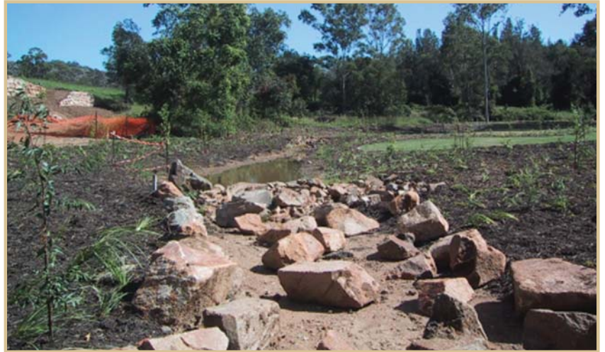
Bioretention filters, part of the stormwater management system, act as communal open space.