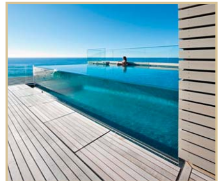
Pool on Roof Terrace