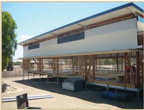
Emu Park School Hall

SUSTAINABLE LAND DEVELOPMENT BUILDING STRUCTURES INTEGRATED WATER MANAGEMENT INFRASTRUCTURE MASTERPLANNING & DESIGN SPECIAL STRUCTURES