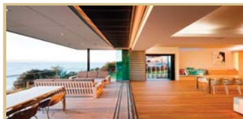
Living Room under Pool